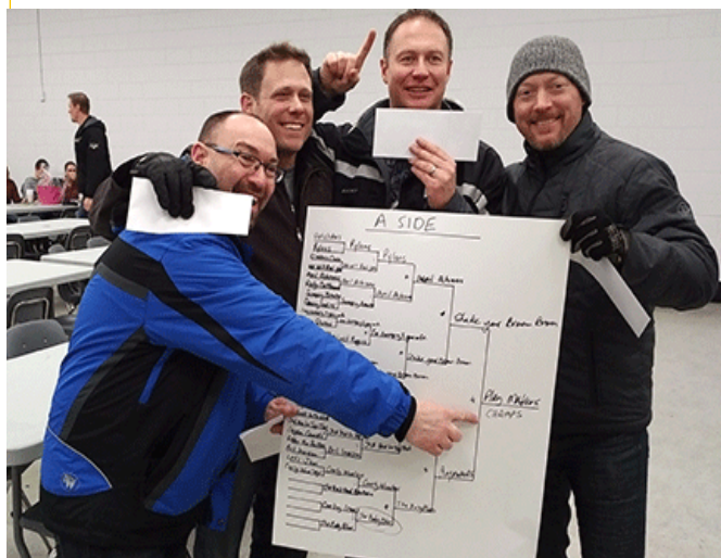
JamPail A Side Winners