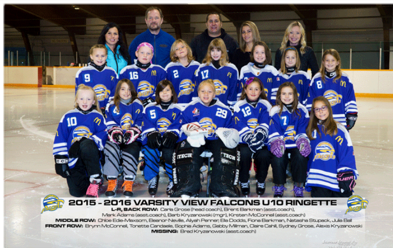
Varsity View's U10 Ringette Wins Brandon Tournament Congratulations Team!!