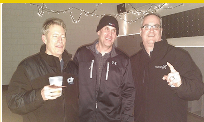
Jam Pail B Side Winners

See you at next year's social on February 4th.