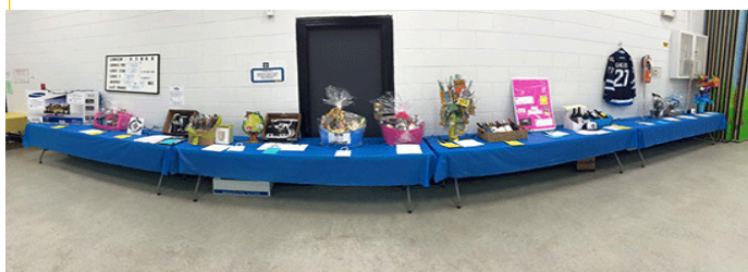
VV Sport Teams Silent Auction