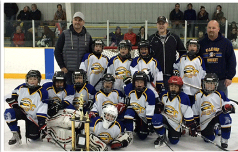
Varsity View's 8A1 Hockey Wins RobWest Tournament Congratulations Team!!